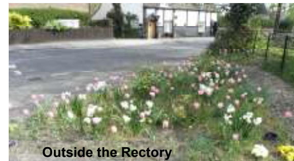
Outside the Rectory

Don't throw those unwanted flower pots away. Just drop them off at Lilac Cottage, High Road, or call either Lee on 398928 or Mo on 384315 and they will collect. Thank you.