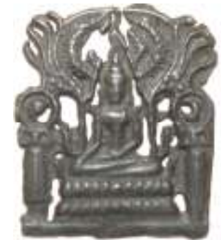
New badge awaiting Authentication Size 44 mm x 40 mm made of Lead/Pewter

Mobile Library The mobile library parks in Clockhouse Lane on Mondays 12.25 p.m.—12.55 p.m.