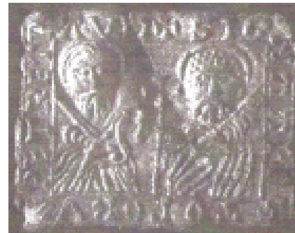
Above is the badge we are still trying to locate which dates back to the 15th century. Size 35 mm x 30 mm.

We will have the badge at the Village Fete for anyone who is interested to see it. Ask at the North Stifford Village Community Group stand.