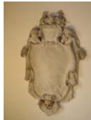
On the wall inside church tower