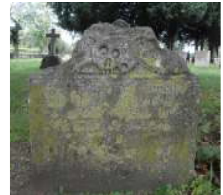
On the left as you approach church entrance