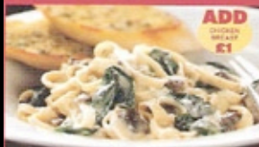
TAGLIATELLE WITH PORTOBELLO MUSHROOMS